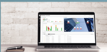
Vista Manager EX